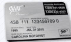
Premier / PremierRV